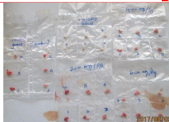
1.1 Wet cotton pellets after surgical removal